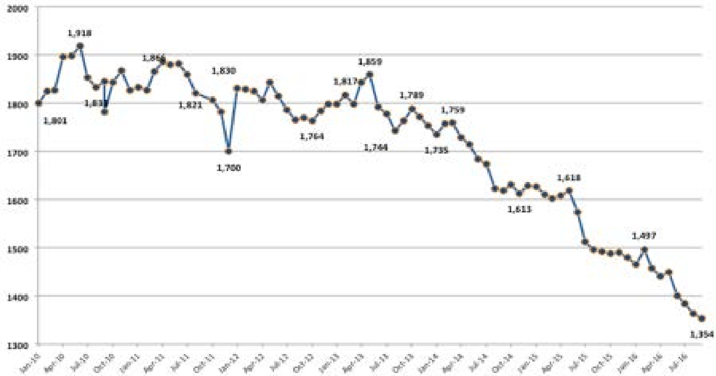
Youth in Behavioral Health Out of Home Treatment Settings 2010 - September 2016